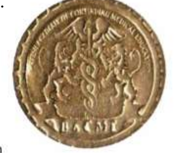
Chair, Committee for Review & Recognition